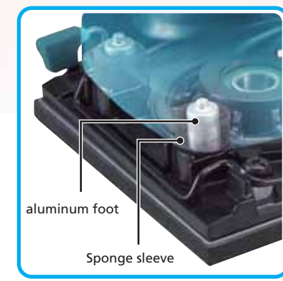
Rigid aluminum foot with dust-proof sponge for longer tool life Enhanced Foot

by aluminum foot and counterweight *In case of using BO4556